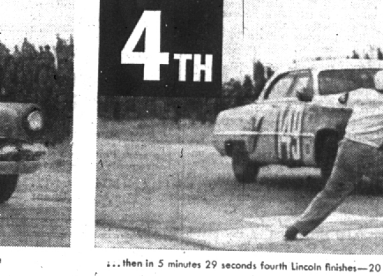
... then in 5 minutes 29 seconds fourth Lincoln finishes—20 minutes ahead of next car.