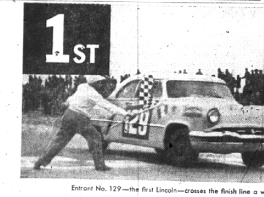
Entrant No. 129—the first Lincoln—crosses the finish line a winner