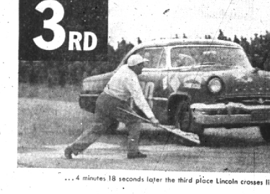
... 4 minutes 18 seconds later the third place Lincoln crosses line