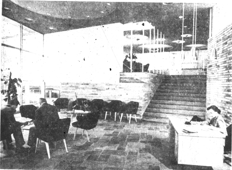
THE MAIN LOBBY and sub lobby of the new MacManus, John & Adams building feature modern furniture, fixtures and lighting. The door at the right rear of the picture leads to the car ports and garages.