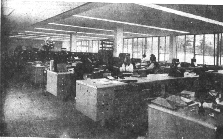
THE COST AND BILLING departments share a light and airy room in the new home of MacManus, John & Adams. The furniture is functional modern.