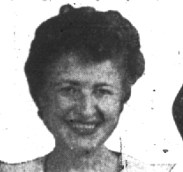
The LADY of CHARM says,

Wonderful texture... natural ripe flavor and coloring... full nutritional goodness! Yes, as a pack for delicious frozen foods to enjoy the year around—Michigan Made Pure Sugar gives you all this and more! Look for the bright red "Michigan Made" seal on the bag when you shop. It's your guide to quality and value!