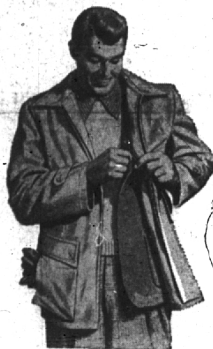
ALL-CLIMATE TRI-THREAT: For any weather, anywhere. Wear it three ways... the smartly tailored, weather-conditioned, "all climate" cloth shell for milder days... the slip-out pure wool lining as the perfect lounge coat... or the shell and lining on those brisk days, out-of-doors. $29.95