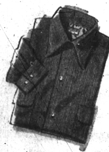
AUTUMN CORD SPORT SHIRT: Long wearing, lustrous, ribbed corduroy in vivid, color-rich, Autumn leaf shades. Especially tailored for perfect performance. $8.95