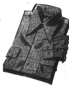
WILLIAM TELL DEERFIELD SPORT SHIRT: Quality rayon and wool-blended flannel creates striking pattern effects. Sturdy, warm and completely washable. $11.95