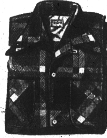
SQUARE DANCE GINGHAM SPORT SHIRT: Dazzling gingham in rich, bold patterns. Made of top quality, val-dyed, washable cotton. Styled with new sweep collar. $5.95