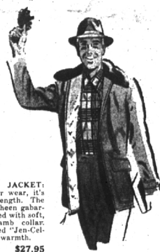
OLYMPIC GAB JACKET: for brisk weather wear, it's the new thigh length. The water repellent sheen gabardine shell is topped with soft, mouton dyed lamb collar. Lined with quilted "Jen-Cel-Lite" for extra warmth. $27.95