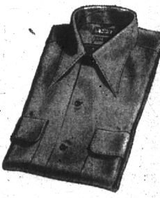
WEEKENDER SPORT SHIRT: Skin smooth, washable rayon with new, smart sweep collar, fashion-wise, bold buttons. Saddle stitch trim at collar, Ragged chest pockets. $5.00