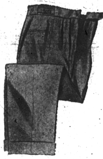
HUGGER SLACKS: Styled for extra comfort, extra action ease... with streamlined fashion features... hidden Hugger waist action... new, low rise, in a wide range of choice quality fabrics. $15.95