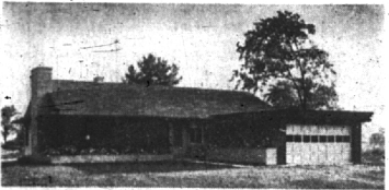
Ranch house in prime location.