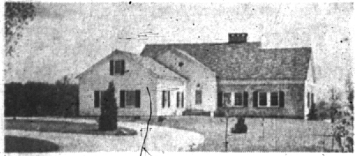
... in the Vaughan School district

Walk through this front door and marvel at the panorama of clean, cool, sparkling water spread out before your eyes below the living room window! A picture of never-ending beauty... all year round... a place of recreation for the entire family... a private lake teeming with fish, spring-fed... and seen from most of the principal rooms.