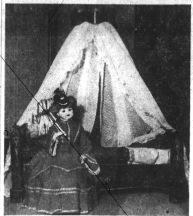
PARISIAN "BEAUTY" To be shown at local tea.

A Parisian beauty of the 1860's will be present at the Oakland county Kappa Delta mothers tea Oct. 18.