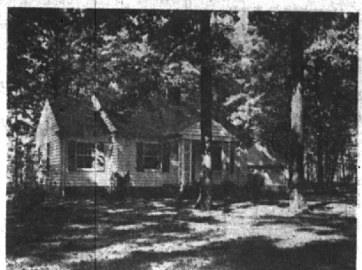
In Franklin Hills

How often you've wished for " . . . one with trees . . . really big ones!" Here's a perfect setting for this charming Franklin home . . . 2 acres . . . and really big ones! Not only the house itself . . . but also the attractive guest house share the shelter of these picturesque forest giants.