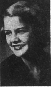
THE KAPPA KAPPA GAMMA