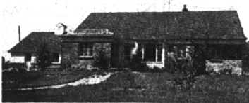
near Oakland Hills Country Club

Suburban living at its finest in this brick Ranch home. Recreation space and living for the entire family.