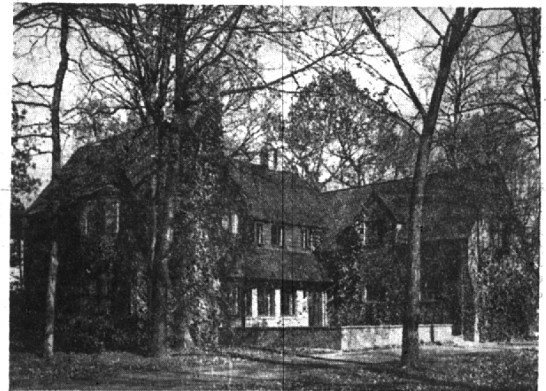
636 Waddington Road, Bloomfield Village

and fine construction are a combination that can spell a delightful home. Add to this excellent room planning, a good heating system, a tip-top neighborhood and low taxes, and you really have something very desirable.