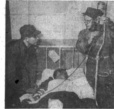
That's what the doctor said after giving a blood transfusion to this seriously wounded soldier in Korea. Sped by air from this country to the Korean battlefield is as little as seven days, blood provided through the American Red Cross becomes literally the liquid lifesaver.

McCLELLAN-BALL CO. YARD SUPPLIES FARM KENNEL BIRMINGHAM, MICHIGAN Phoné MI 4-4133 159 Brownell St.