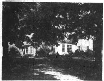
on 10 acres near Birmingham