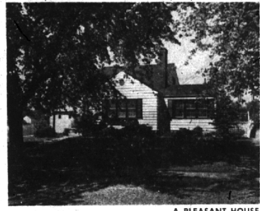
A PLEASANT HOUSE

"I want a good home, well located, and fairly priced". Have you said that? Well here it is. Built in that banner year of 1940. Living room with fireplace. Sunny separate dining room. Library to provide space for television. Two bedrooms and bath on 1st floor. Large bedroom and storage on 2nd floor. New Bryant gas heating plant. Carpets. Fenced yard.