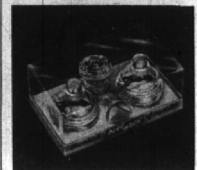
DELUXE SALT & PEPPER SET $2.50

Rain or Shine Your Food Stays Krisp and Tasty