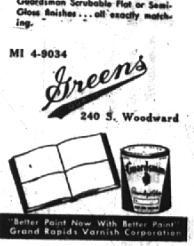
Better Paint Now With Better Paint Guard Rapid Varnish Corporation

Now you can get all of the 23 exciting new House and Garden Colors for 1951 in Guardsman Personalized Colors — plus hundreds of other new Guardsman colors! We'll mix them for you with precision accuracy — in the fine Guardsman Scrutable Flat or Semi-Gloss finishes — all easily matching.