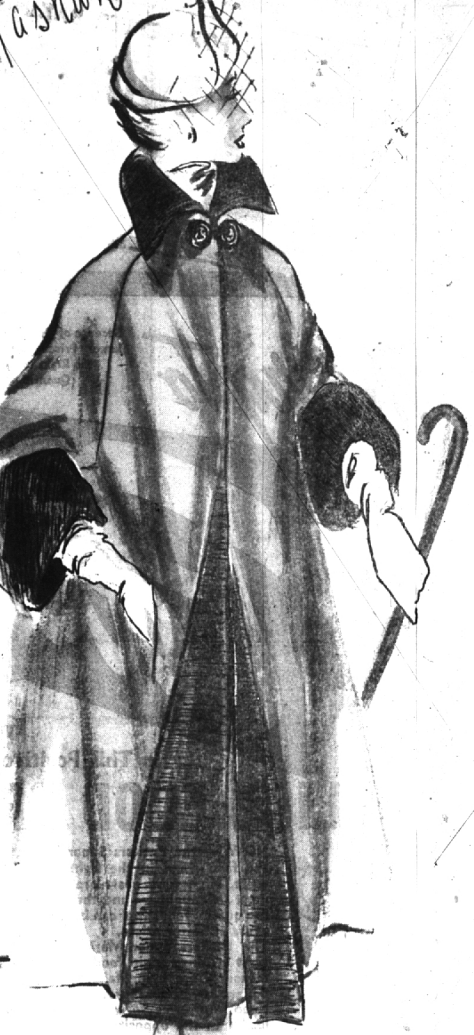
Reversible Coat of Wool Fleece and Faillie ---- $45