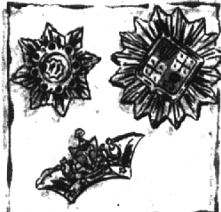
Miniature Scatter Pins...$1 ea. plus tax