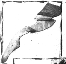
Phoenix 51-15 Nylons ---- $1.75