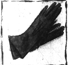
Wearright Gloves ---- $1.95