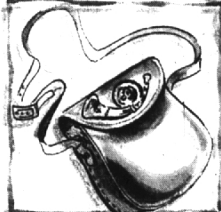
Saddle Leather Bag ---- $5.98 plus tax