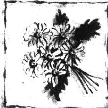
Costume Flowers ---- $1

Accessories to accentuate Mood Spring Fashion