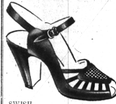
SWISH Rice O'Neill—To be sure! Fine Navy Doekin—Sandal.