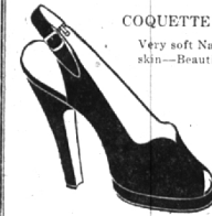
COQUETTE Very soft Navy calf-skin—Beautiful!