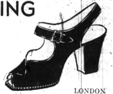
LONDON Fine Navy calf—Dark gray color trim.