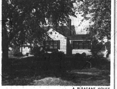
A PLEASANT HOUSE

"I want a good home, well located, and fairly priced." Have you said that? Well here it is.