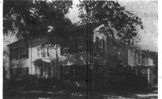
283 Lake Park Drive

You can almost imagine a Louise May Alcott heroine stepping out of that doorway. Or some tough old sea captain on his way to board his Indian-ship.