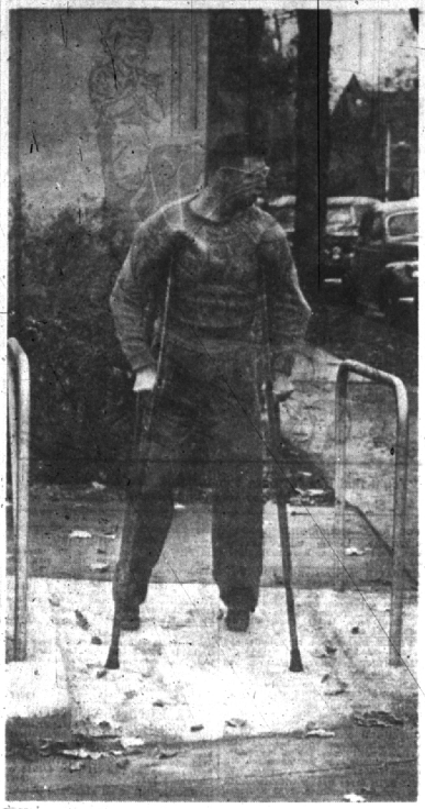
RAMPS CAUSE NO ACCIDENTS IN KALAMAZOO But B'ham will have them, says DPW