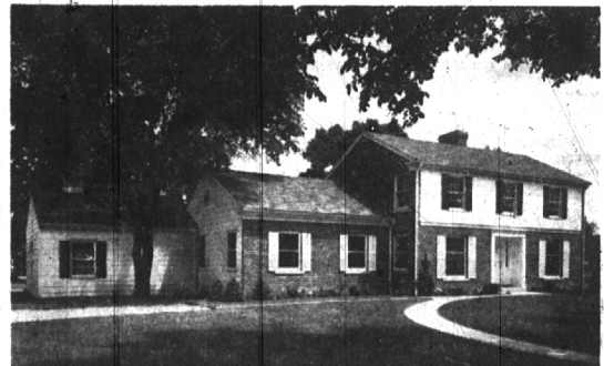
Waddington Rd.—Bloomfield Village

First floor bedrms. in 2 story houses are almost impossible to find. Here is an exception. Built last year, custom designed for discriminating owners, there are many other unique features in this attractive home.