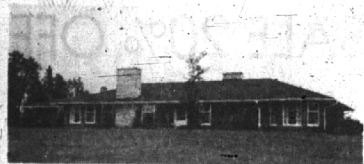
overlooking Kingswood and Cranbrook

A delightful and charming deluxe ranch home . . . a magnificent hilltop view over Kingswood and Cranbrook . . . a neighborhood environment without equal in the De-trait suburban area. One-floor living at its best . . . and a location par excellence for your lifetime. ● Inviting center entrance hall . . . the Living Room straight ahead and down two steps . . . with a view out over the Hills area from every corner of the room. ● Library to the left . . . 16 by 22 paneled, with fireplace . . . Powder Room and color-tiled Lavatory to the right. ● 3 large Bedrooms . . . twin walk-in closets . . . and 2 superb, colorful tiled Baths. ● Immaculate Kitchen . . . plus wide, sunny breakfast bay . . . a "picture ensemble". ● First floor laundry . . . gleaming white trays . . . storage cupboards. ● Large two-car garage . . . plenty of closets and storage for all purposes. ● Extra features: Mahogany panelling in living Room . . . wide fireplace . . . roomy paneled Library . . . with fireplace . . . Sun Room or Den overlooking the valley . . . hot water heat . . . pumped circulation . . . aluminum storms and screens . . . 4 acres of rolling land. Taxes and heating are most reasonable.