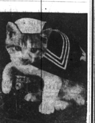
WATCH THE KITTY—For the benefit of those who haven't guessed, this feline photographer is a mascot for a Navy unit—a photographic unit, of course. "Hypo" and his outfit are attached to the Far East command.