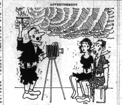
"Don't worry, folks, I got the picture and you'll find clothing stores listed in the Yellow Pages of the telephone directory."