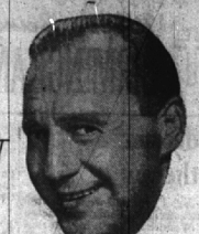
Jack Benny, star of "THE JACK BENNY SHOW" heard every Sunday over CBS, coast to coast

Jack Benny saves many a penny ... with his modern Electric Range!