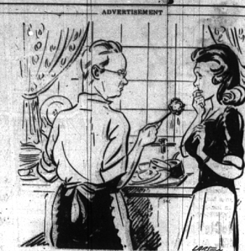
"And listen, darling, the next time you need kitchen help, please find a reliable agency in the telephone directory Yellow Pages."