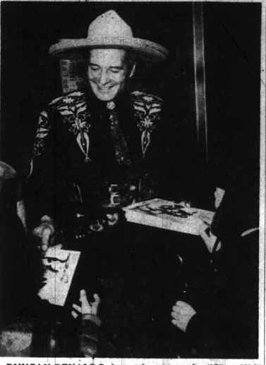
DUNCAN RENALDO, better known as the "Cisco Kid" presented autographed photos of himself to youthful admirers at the Packer Super Market, South Woodward Friday afternoon. Renaldo plays the famed Western adventure man in movies, radio and television. The local visit was part of his personal appearance tour of Packer markets in the metropolitan area last weekend.

Gorham "Chantilly". Here is sterling silver design at its very best... Gorham Sterling... to be used with glowing pride every day! Illustrated in Gorham Chantilly, America's most-loved pattern, a favorite since 1851! You can start your Gorham with only one place-setting — six pieces of solid silver, for as little as $70. (Fed. tax incl.) depending on the pattern. Come in today! LLOYD LAKE JEWELER Hours Daily: 9:00-5:30 Friday: 9:00 A.M.-9 P.M. BIRMINGHAM 69 W. Maple Midwest 4-5315 "The Sterling Store of Birmingham"