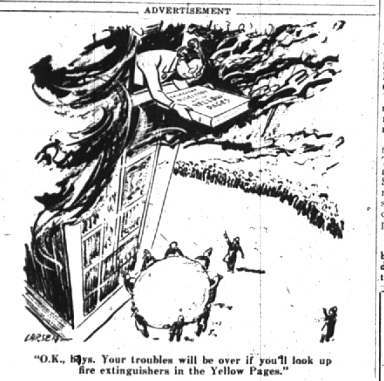
"O.K., Mrs. Your troubles will be over if you'll look up fire extinguishers in the Yellow Pages."

Complete Insurance Coverage Phone Midwest 4-1598 1085 Hazel Birmingham