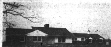
in Franklin's rolling hills

Designed for an exacting owner... thought and care in every detail... the best of materials and the finest workmanship. Deluxe in construction... delightful to live in... a lifetime of living enjoyment.