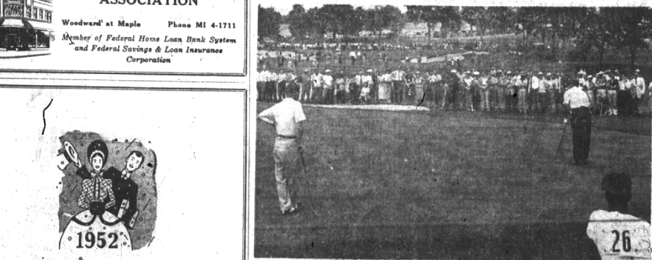
AT THE OPEN—Frank Stranahan, famed Toledo amateur watches his putt barely miss the eighth hole as Craig Wood, 1941 National Open champion, looks on. A sizeable gallery followed this pair around the Oakland Hills course.