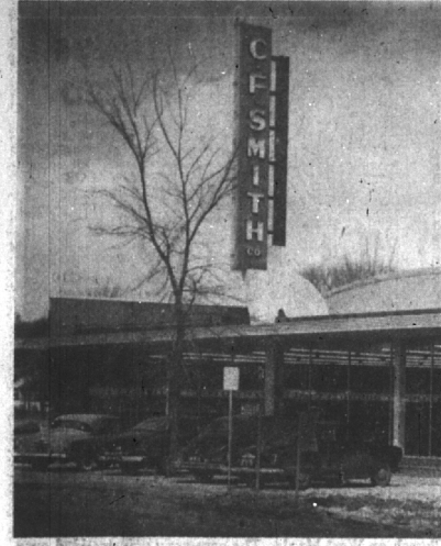
C. F. SMITH'S "Golden Anniversary" supermarket on Hunter boulevard at Hazel opened for business March 20. The modernistic market is the largest of the chain's 300 stores in the metropolitan area.