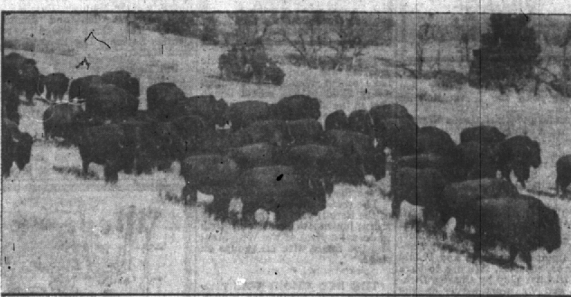
BUFFALOED BY SIREN —A herd of buffalo in Custer State Park, South Dakota, and themselves in a roundup controlled by a jeep seen in center background. Twelve of the buffalo were chosen from a wild herd of 1500 head to be exhibited for the first time at Chicago's 52nd International Livestock Exposition. Ancestors of this herd probably met with more success in breaking from round-up, with only a couple of horses to keep over. The siren-equipped jeep, however, keeps them grouped and directed merely by blowing the shrill horn to scare the animals into "position." The dozen selected for exhibition will be sold at auction, probably to some of Chicago's hotels—for a good price. So, if you're in the Windy City and order buffalo steak in the near future, remember the rareness of the animals and don't kick about the possibly exorbitant "buffalo bill."