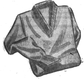
Pullover and coat sweaters. Wools, nylons, mixtures. Many colors. $6.95 up