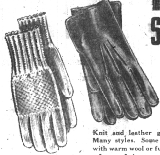
Knit and leather gloves. Many styles. Some lined with warm wool or fur. All colors and sizes. $1.95 to $7.95

See our huge collection of Gifts for Him—and whatever his build... whatever his tastes you're sure to find just the gifts he'll give happy thanks for—for many a month to come. Wonderfully—our top quality gift group has budget wary price tags.