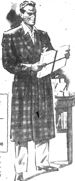
Lounging robes in his favorite classic styles. Wool flannels and rayons. Many colors. $11.95 to $25.00

White and colored dress shirts. Newest cuff and collar styles. All sizes by Manhattan and other famous makers. Choose several. From $3.50