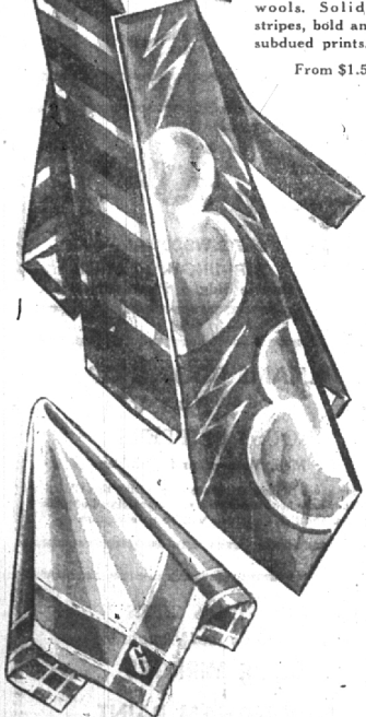
Fine monogrammed and plain handkerchiefs. Pure lins. White, colors, color trims. 39c up