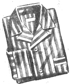
All pajama styles by famous makers. Cottons, silks, prints and plains. $3.95 up

All wool, nylon and mixture hose. Plain and patterned types. Great color choice. All sizes. From 75c