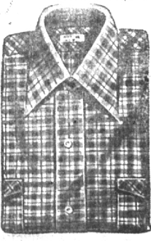
Printed and plain, long sleeve sport shirts. Wools, cottons, mixtures. All sizes. From $3.95