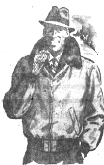
Outdoor jackets in a variety of warm, quality styles. Some with fur collars, wool linings. From $19.95 Others from $10.95