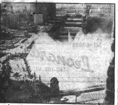
DAMP DISPLAY —Scores of fire hoses send streams of water shooting skyward to form a wall of water six stories high along the south end of the Chicago River during a mock air-raid demonstration in the Windy City. Purpose of the "water wall" is to keep fires from jumping the river and spreading. Note anti-aircraft guns.