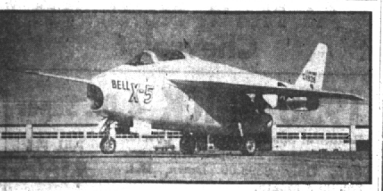
WHAT NEXT? WHY MOVABLE WINGS! —Newest plane to write headlines in the sky is the 10,000 pound Bell X-5, an experimental aircraft with sweepback wings that can be moved during flight. For takeoff, quick climb and landing, the pilot can adjust the wings to a forward position. Test flights at Edwards Air Force Base, Muroc, Calif., will demonstrate the pilot's ability to increase his speed at high altitudes by adjusting the wing's sweep-back.