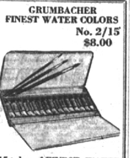
15 tubes of FINEST WATER COLORS in metal box with hinged cover for mixing and brushes.

Birmingham showed remarkable improvement in shooting accuracy. The Maples sank 36 per cent of their shots from the floor as compared to 30 per cent in the Troy game.