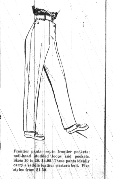
Frontier pants—set-in frontier pockets; nail-head studded loops and pockets. Sizes 10 to 20. $4.95. These pants ideally carry a saddle leather western belt. Five styles from $1.50.