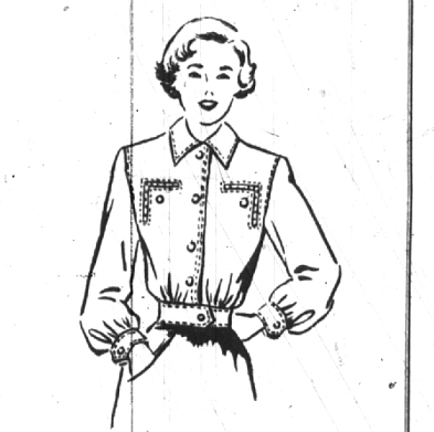
The Battle Jacket is waist length, close fitting. Has two frontier pockets on chest. Goes ideally with frontier pants or skirt. Battle jacket is $6.95, and is in sizes 10 to 20.

Finally someone has done something about properly fashioning blue denims... This tough and practical fabric is usually sewn together by overall manufacturers, totally devoid of style. Here is a group of finely made garments, coupling the natural wear of denim with the fine, free fashioning of the Southwest.