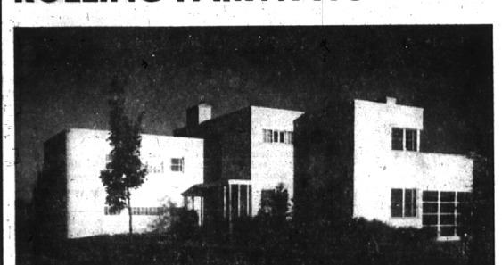
... and a winding stream

Years ahead of its time . . . this charming contemporary home . . . and impossible to duplicate today. Warm birch panelling . . . aluminum windows and screens . . . interesting floor levels . . . first floor laundry . . . upstairs library with fireplace . . . mid-level living and Play Room . . . screened porch with dining grill.