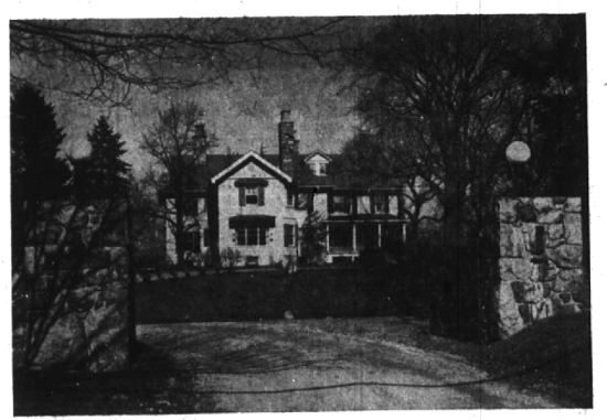
The Original "Stoney Croft"—Opdyke Road

The true heritage of gracious living is embodied here in this fine old family home full of peace and contentment. Mellowed through the years not only by time, and occupied by a resident owner who really knows the "art of living," you will find all the enchantments and charms of "home" and even a touch of nostalgia.