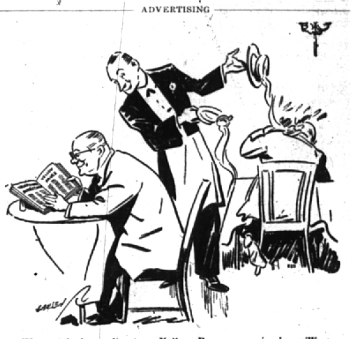
"These telephone directory Yellow Pages are simply spilling over with useful information."