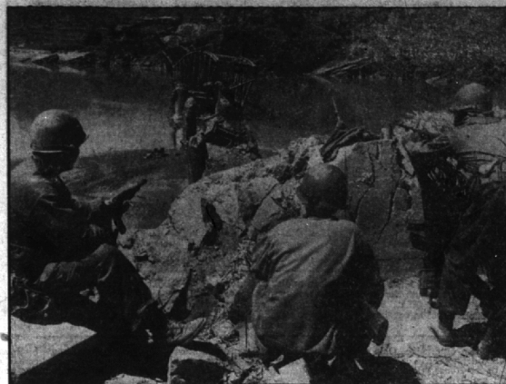
STOP, LOOK AND LISTEN —Three members of an American scouting party near the Nakdong River stop, look and listen after observing the enemy on the opposite bank. The North Koreans were forced to regroup their forces after Army engineers dynamited the bridge in their path. Returning to intelligence headquarters, these three G.I.'s reported their findings to superior officers, who will plan new incursions for the Communist invaders.