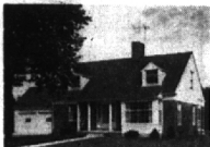
565 S. Glenhurst Dr.