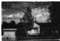
797 S. Glenhurst Dr.