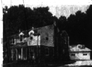
693 N. Glenhurst Dr.