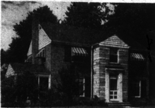
515 N. Glenhurst Dr.