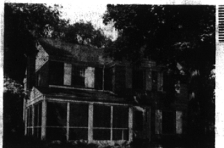
535 N. Glenhurst Dr.