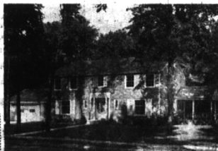
736 N. Glenhurst Dr.

The R. G. Hoover Corporation was formed in 1935. Since that time the company has been building fine homes throughout this area—for the past 10 years in Birmingham. The pictures illustrated on this page show the good taste and quality that goes into every Hoover home.