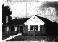
596 S. Glenhurst Dr.