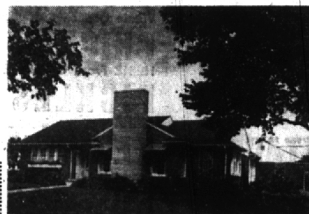
593 S. Glenhurst Dr.

All of the homes illustrated are located on North and South Glenhurst Drive.