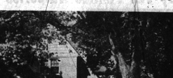
Photograph of a house in Quanton Lake Estates.