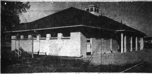
BUILDING IN USE THROUGHOUT THE YEAR Includes equal units for home and visiting teams.