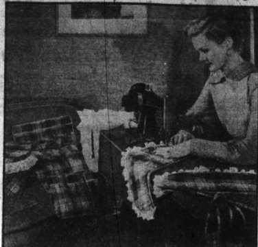
To encourage her daughter's neatness, this mother stitches up accessories for a glamor closet. Gay plaid pieces, trimmed with eyellet ruff, include a hat box, shoe bag, shoulder covers and slipper bags.

To keep the closet floor uncluttered, make a shoe bag for the inside of the door. This should include a back section 18 inches wide, and enough fabric strips, reinforced with cardboard or buckram, sewed on at intervals, to form pouches for four to six pairs of shoes. A covered hat box is next on the list. Make a paper pattern by tracing the box. Add a half-inch all around for seam allowance.