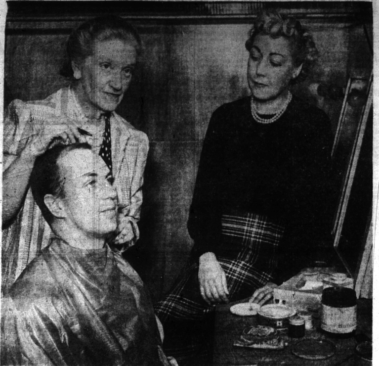
The Village Players are putting the finishing touches to their next production "Two Blind Mice" which opens tomorrow, March 24, and runs again on the 25th and 31st and on April 1.