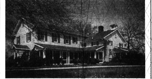
Maple Rd. in West Bloomfield

Some things money can buy here will be—that inner sense of security and well-being which comes from knowing you have a home you're proud of—one that your family enjoys bringing friends back to and one for properly displaying your Blue Ribbons, Trophy Cups, et-cetera. Elegantly executed details include these features: Large Reception Hall, 15 x 18, with fireplace. Paneled Trophy Room with fireplace (25 x 29) on first floor. Charming Library, carpeted. J. L. Hudson Kitchen with Napanee Cabinets. 6 Spacious Bedrooms, 3 Lovely Baths. Out-of-doors are these facilities: Fruit Trees, 70 Rolling Acres, Berry Patches. Playhouse for your Children. Handsome Kennels with Runways for 12. Trim Barn with Box Stalls, Paneled Tack Room. Here's a home of distinction for a man of distinction. Nothing needs doing. The price is well below reproduction cost and only $52,500.00.