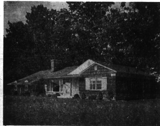
5920 Indianwood Trail

Picture windows in living room look out toward Wing Lake, where you enjoy complete privileges such as boating, swimming and fishing.