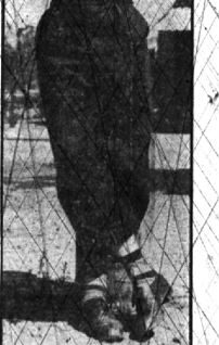
RED GOES WEST —One of many Communist youths taking refuge in West Berlin, afraid of Red reprisals if they return to their homes in Eastern Germany, appears to enjoy a taste of freedom after his escape. He is behind the Iron Curtain. Though still wearing the blue uniform shirt of the Communist Youth Organization, he has ripped off the insignia and wears American tie and necktie, gift of the U.S. Red Cross.

News copy submitted early necessarily is given preference over late items. The "early bird" usually gets the space.