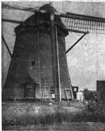
TO BE REPLACED BY ELECTRIC PUMPS? Dutch housewife hopes not

The function of the Hundsdyk mill, now as then, is to keep the polder land dry in winter and wet in summer. When the winter rains come, the mill pumps water from the polder side to the river ditch;