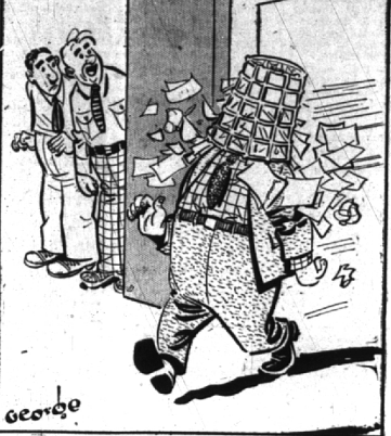
"The boss must be in a playful mood today—Charlie went in to ask for a raise!"

WANTED TO RENT—HOUSES AND APARTMENTS EXECUTIVE and wife desires a three or four room apt. private bath and entrance. Phone 4-1100.