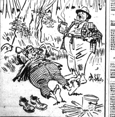
"Personally, I don't care about money—it wuz always the landlord, the butcher and the grocer that wanted it!"

PERSONALLY, I DON'T CARE ABOUT MONEY—IT WUZ ALWAYS THE LANDLORD, THE BUTCHER AND THE GROCER THAT WANTED IT!