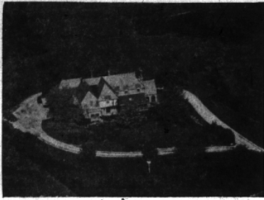
From this eminence every room overlooks verdant rolling countryside. A sparkling lake lies to the North, and to the East—it is really beautiful.

The residence was custom built with a Vermont slate roof . . . 2 broad porches flank the Eastern and Southern exterior. On the first floor: a Living Room 17x27.6 . . . a Dining Room 16.9x15.3 . . . paneled Library 15x15 . . . Breakfast Room . . . tiled Kitchen . . . Lavatory and a broad welcoming entrance hall . . . 4 roomy family Bedrooms and 3 fully tiled Baths and 2 servant's rooms and bath comprise the 2nd floor. You will agree there are plenty of closets. Recreation Room and Bar in the Basement . . . 3 car attached garage.