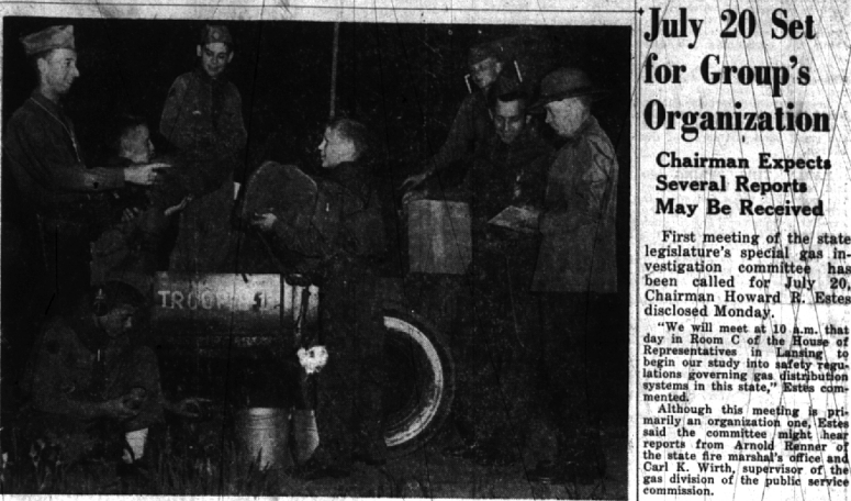
TROOP B-1 OFFICIALS, MEMBERS LOAD EQUIPMENT FOR NORTHERN TRIP. 16 boys are set for a week's vacation away from civilization