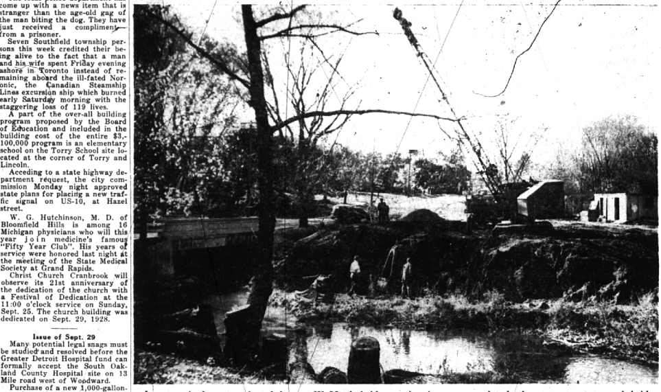
New West Maple Bridge Construction Is Started in October

Under construction for nearly a year and a half, this new, modern Michigan Bell exchange was occupied in September by the company's local business office. Installation of the automatic dial equipment, also begun in September, will not be completed until early next summer when the local exchange will be cut over to the dial facilities.