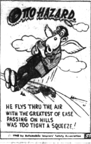
HE FLIES THRU THE AIR WITH THE GREATEST OF EASE PASSING ON HILLS WAS TOO TIGHT A SQUEEZE!

During these bleak months of the year, owners place baskets of bright flowers on the graves, along with permanent wreaths and in some cases, blankets of myrtle. The summer months find it with growing plants, thriving under the expert care of the caretaker.